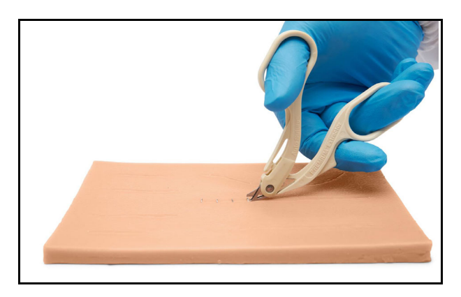
Skin Pad: Staple