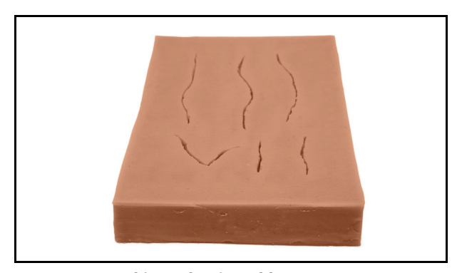
Skin Pad: Injectable Suture