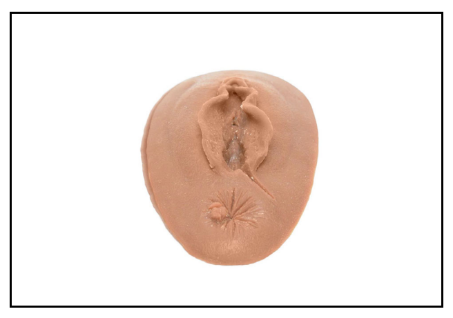
CAE Medicor Vaginal Model: Hemorrhoid and Episiotomy Model