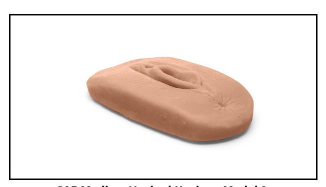
CAE Medicor Vaginal Hygiene Model 2

These models are intended as platforms for the practice of hygiene, catheterization, and other skills. Models with a belt may be worn by a manikin.