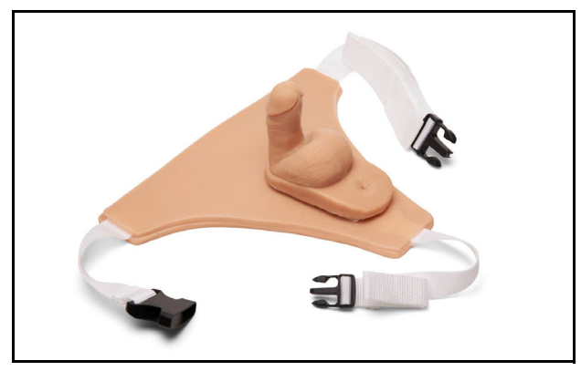
CAE Medicor Scrotal Male Hygiene Model with Belt