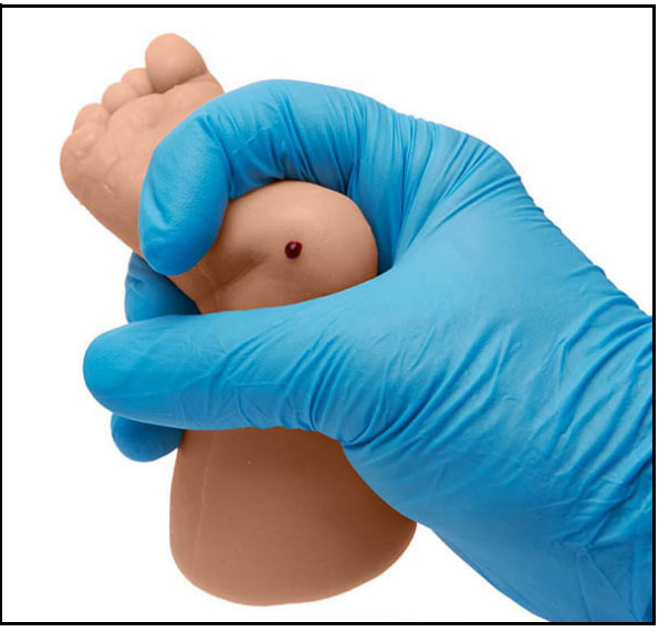
Extracting a Blood Droplet

To practice blood sampling, gently squeeze the heel of the foot to extract a blood droplet.