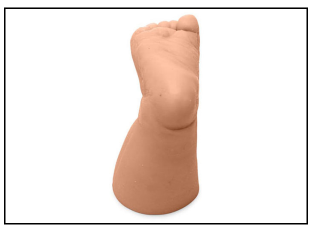
CAE Medicor Infant Foot for Blood Sampling

This model is intended as a platform for the practice of blood extraction for newborn blood sampling.