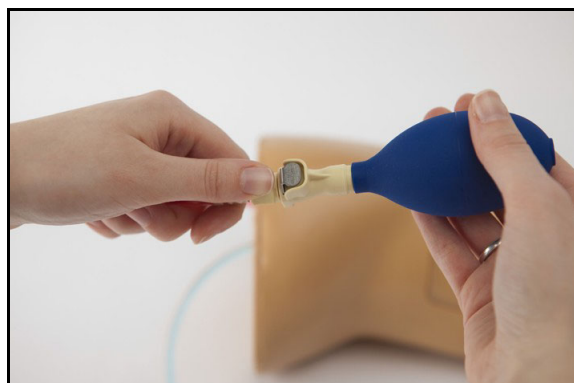
Quick-Disconnect - Hand Bulb