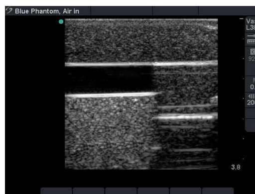
Low Fluid Level - Poor Imaging

A low fluid environment is identified by the inability to see the vessel during normal ultrasound imaging. This is due to the presence of air, which reflects all sound energy.