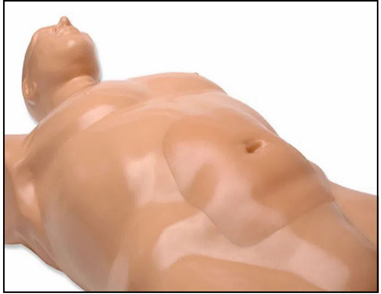
Ultrasound Training Model

This model is intended as a platform for the practice of ultrasound examination of an abdominal aortic aneurysm.