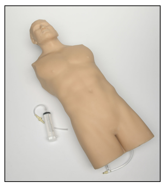
Ultrasound Training Model

NOTE: Transesophageal echocardiogram has two common abbreviations, TEE and TOE (from the alternate spelling: trans-oesophageal).