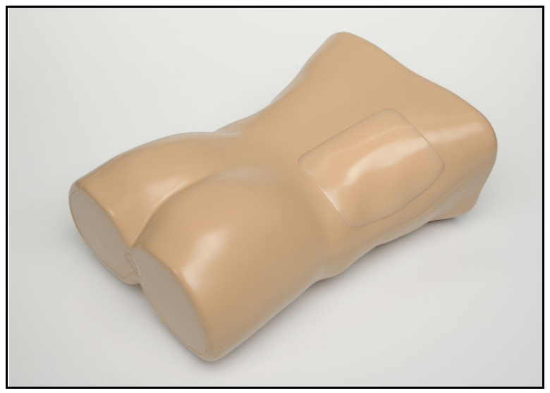
Renal Biopsy Ultrasound Training Model

These models are intended as platforms for the practice of ultrasound-guided renal biopsy.