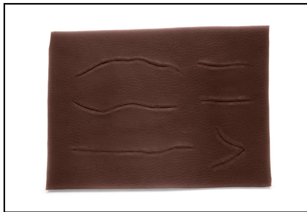
Skin Pad: Suture

These training models are intended as platforms for the practice of various techniques of suturing and stapling.