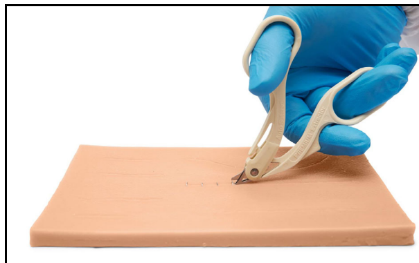
Skin Pad: Staple